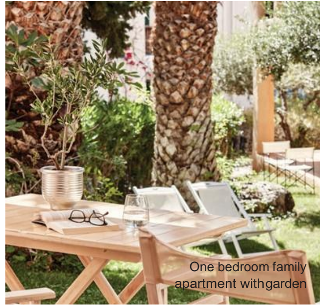
One bedroom family apartment with garden