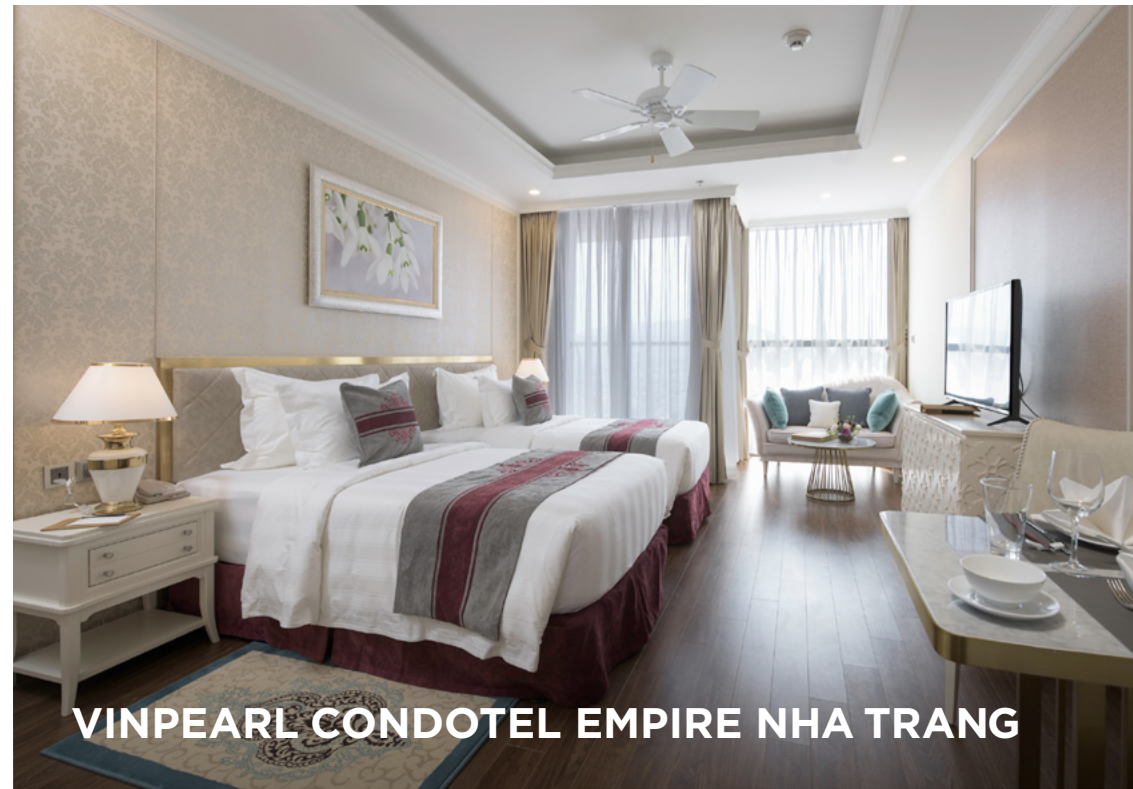
VINPEARL CONDOTEL EMPIRE NHA TRANG