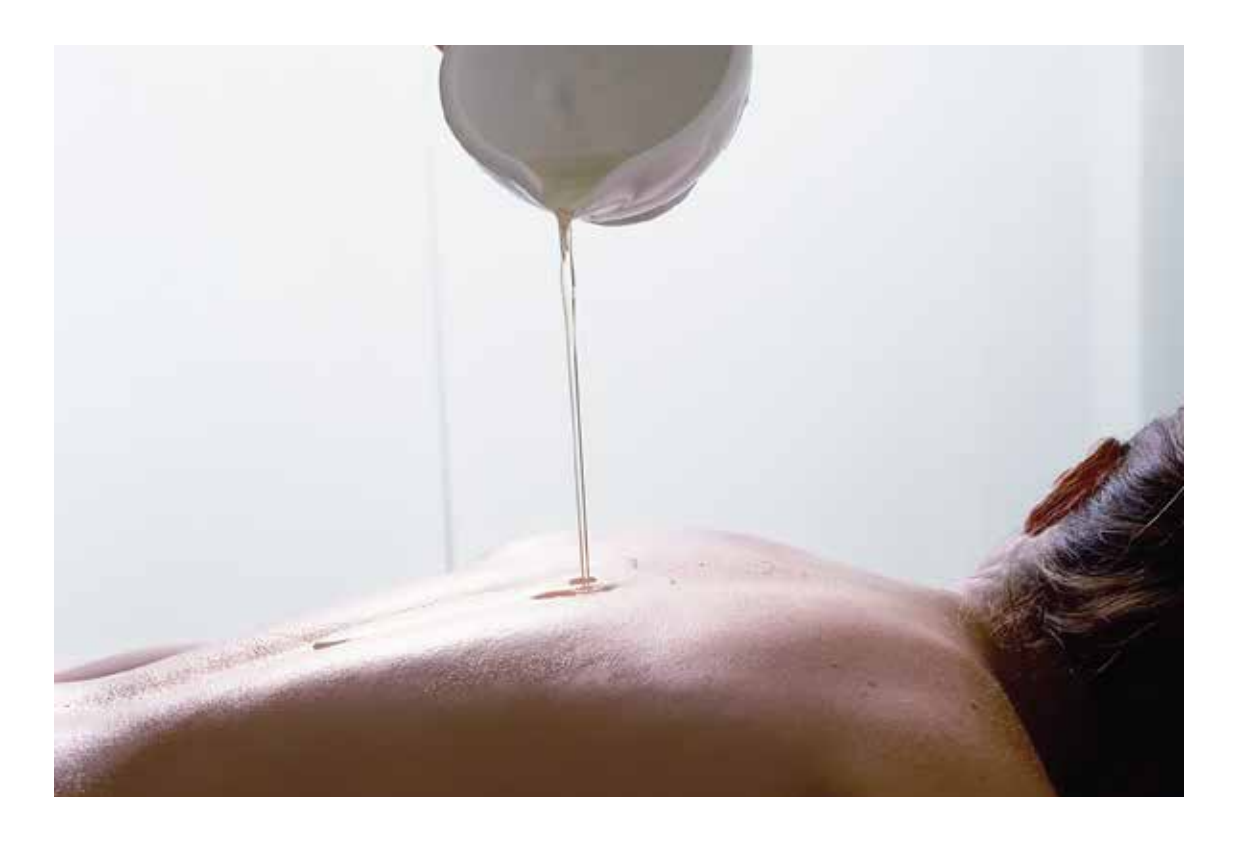
MILKY 30 mins, US$ 45.00

Soak in the perfume of the apsaras. Fragrant rose, lotus petals and eucalyptus combine with basil milk to deeply hydrate, soothe and renew, refreshing and relaxing.