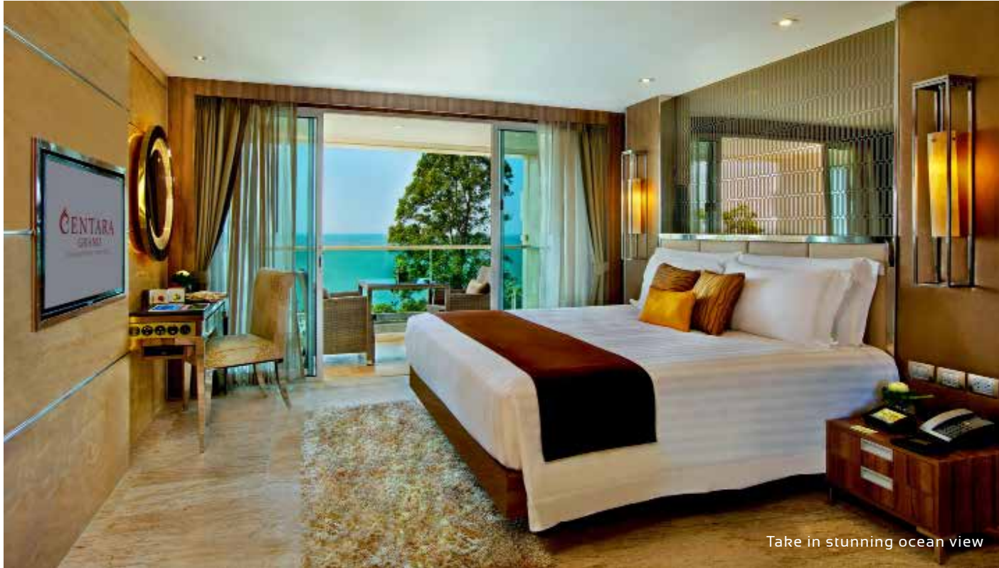
Take in stunning ocean view