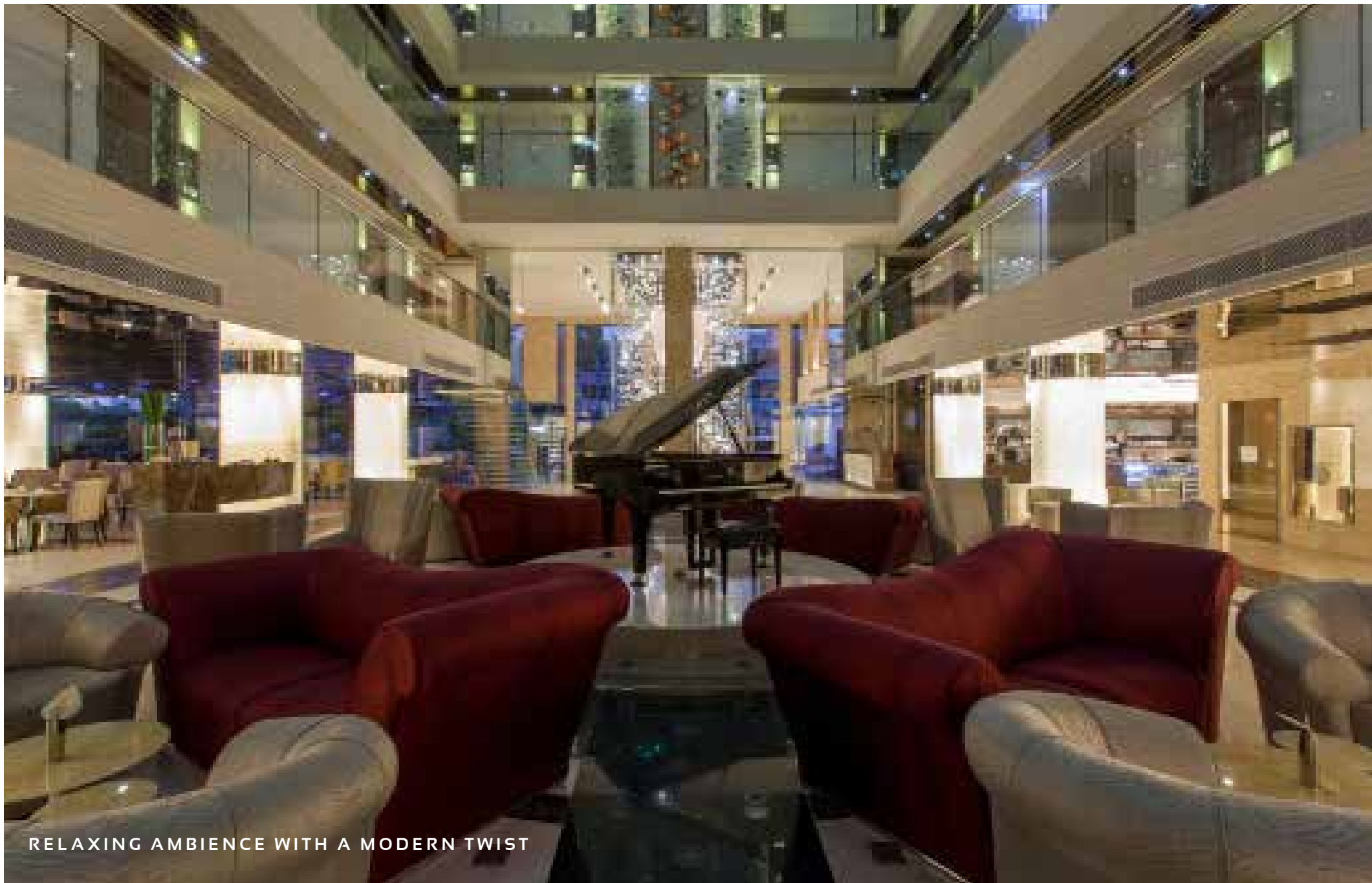
RELAXING AMBIENCE WITH A MODERN TWIST