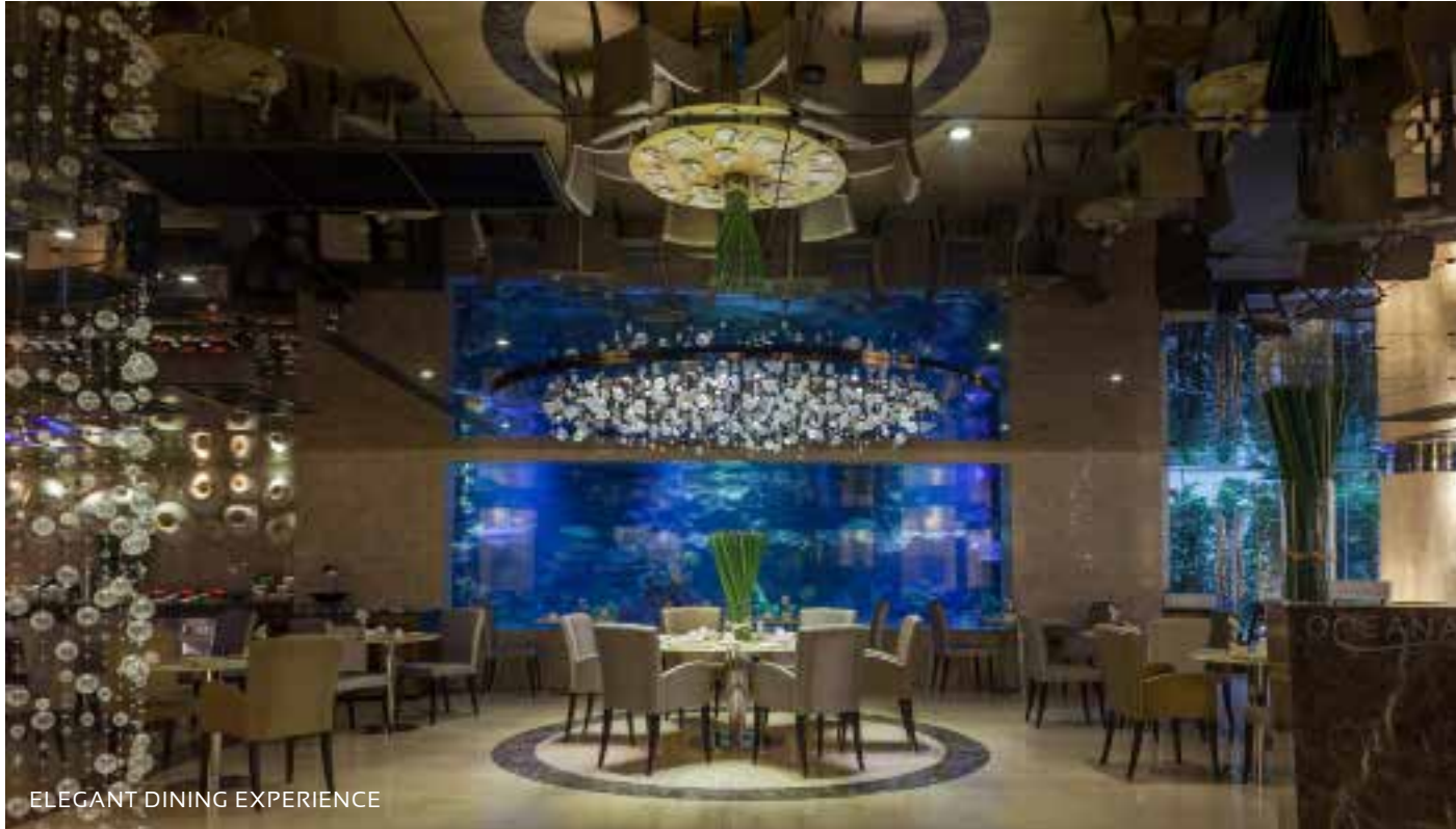
ELEGANT DINING EXPERIENCE