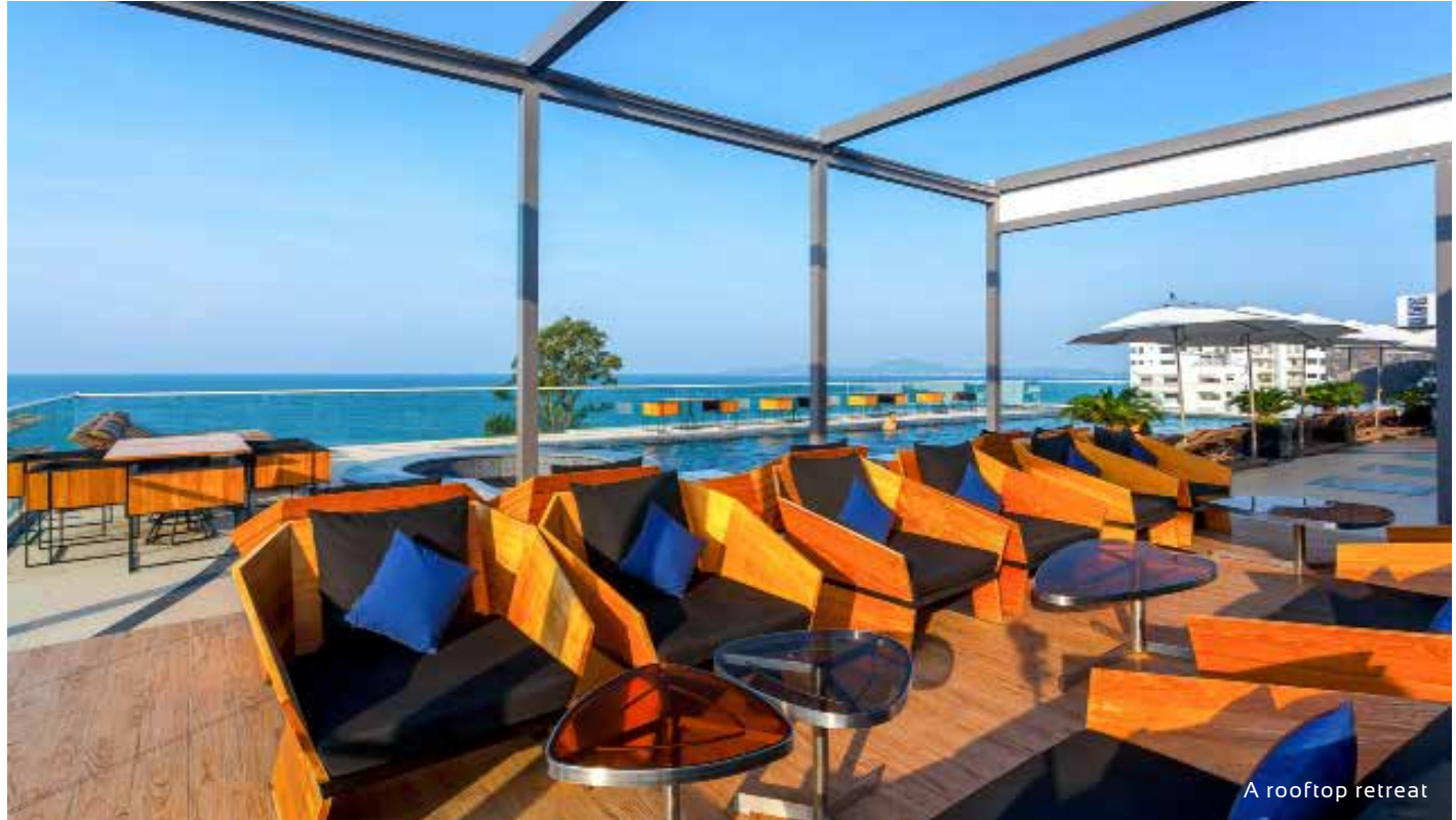
A rooftop retreat