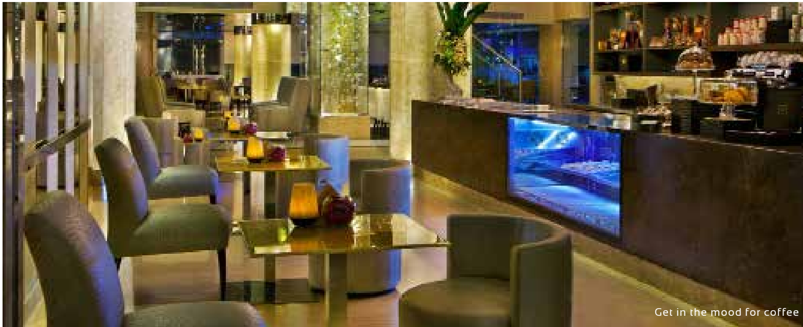
Get in the mood for coffee