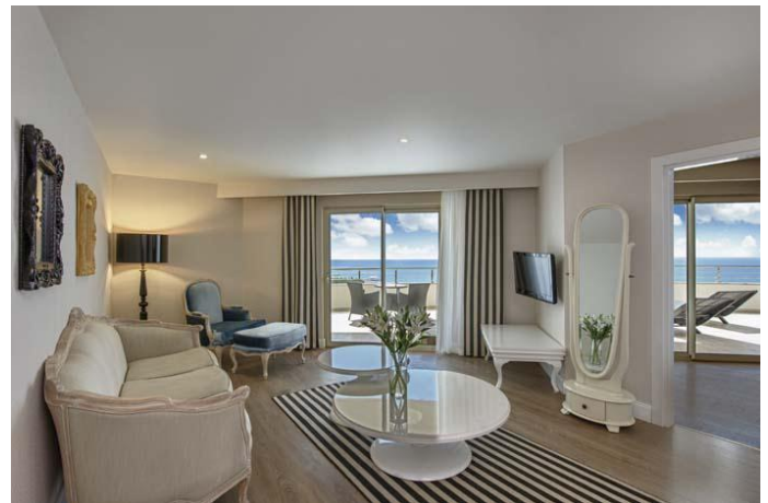
Suite Living room

Suite: in total 2 bedrooms, 58 m 2 , 1 bedroom (1 double bed), 1 living room, 1 shower/WC and terrace (jacuzzi is located on the terrace). The feautres are air conditioning (central, between certain hours), hair dryer, direct telephone, LCD TV (satellite), music, safe, mini bar, Laminate, kettle, tea and coffee. Every day housekeeping, towels are changed every day, and sheets every 2 days 1 time. View of the room: Sea Side View (Accommodation type maximum 2 adults).